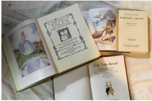
A Treasury of Tales for Little Folks/Robinson Crusoe/Folk Tales Retold