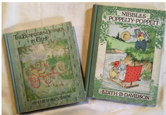
The Bennikins-Bunnies at Camp/ Nibbles Poppety-Poppett

Why do we save certain books or toys? And then in time, wonder why we did? But gratefully, these books were saved and with them we are rewarded with one more glimpse into growing up at the Homestead.