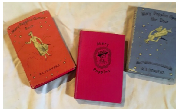
Mary Poppins Comes Back/Mary Poppins/ Mary Poppins Opens the Door